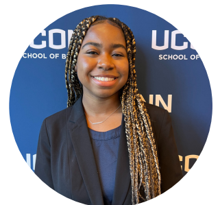
Reagan Kerr Women in Business Committee