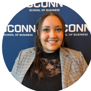
Noor Elhamouly Sports in Business Committee